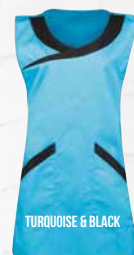
TURQUOISE & BLACK