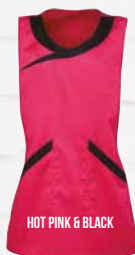
HOT PINK & BLACK